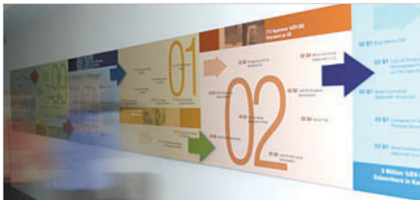
Client: Qualcomm, inc Project: History of Qualcomm engineering highlights on wall panels in main hall - Years 1998 - 2005 Role: Design & production; worked within marketing